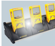
Five unit cradle charger

Environmental and Gas Monitoring Ltd. Unit 5 Barrmill Road Galston Ayrshire KA4 8HH