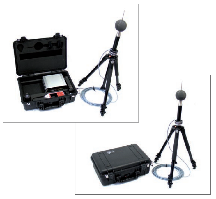
CK:670 Outdoor Kit shown with optional CT:7 Tripod

NoiseTools will display verification symbols if the information matches, a unique feature which will be useful in any legal proceedings.